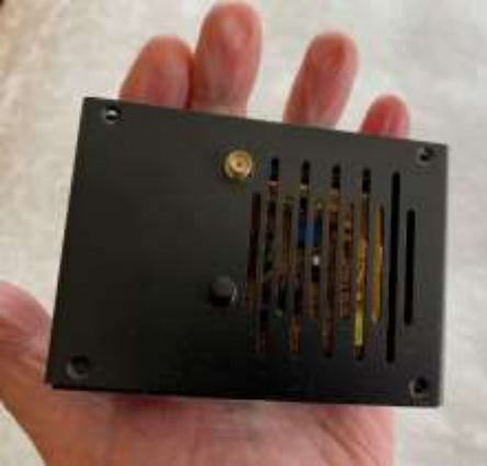
Ted's mini radio can reach Spain and UK.

After World War 1, valve technology replace the spark-gap. Valves were not cheap, but used less power and sent voice and music in addition to Morse. It became possible for amateur enthusiasts – or hams - to make their own receiving and transmitting equipment. By 1930, for a few dollars you could buy a crystal set radio that you could assemble yourself.